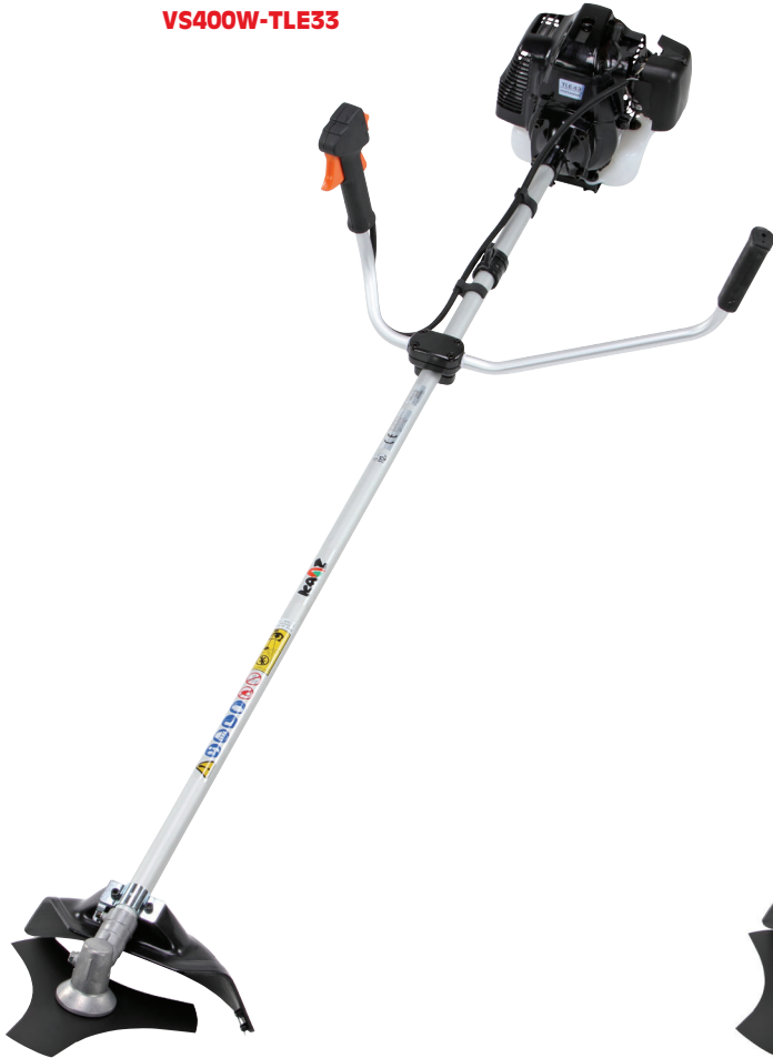
Figures from Kaaz Technical department